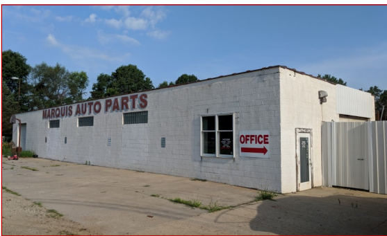
Former auto salvage yard (Marquis Auto Parts)