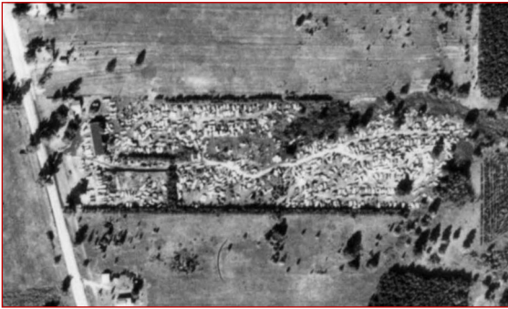
Aerial photo of former auto salvage yard (1967)

23492 RED ARROW HIGHWAY, MATTAWAN, MICHIGAN